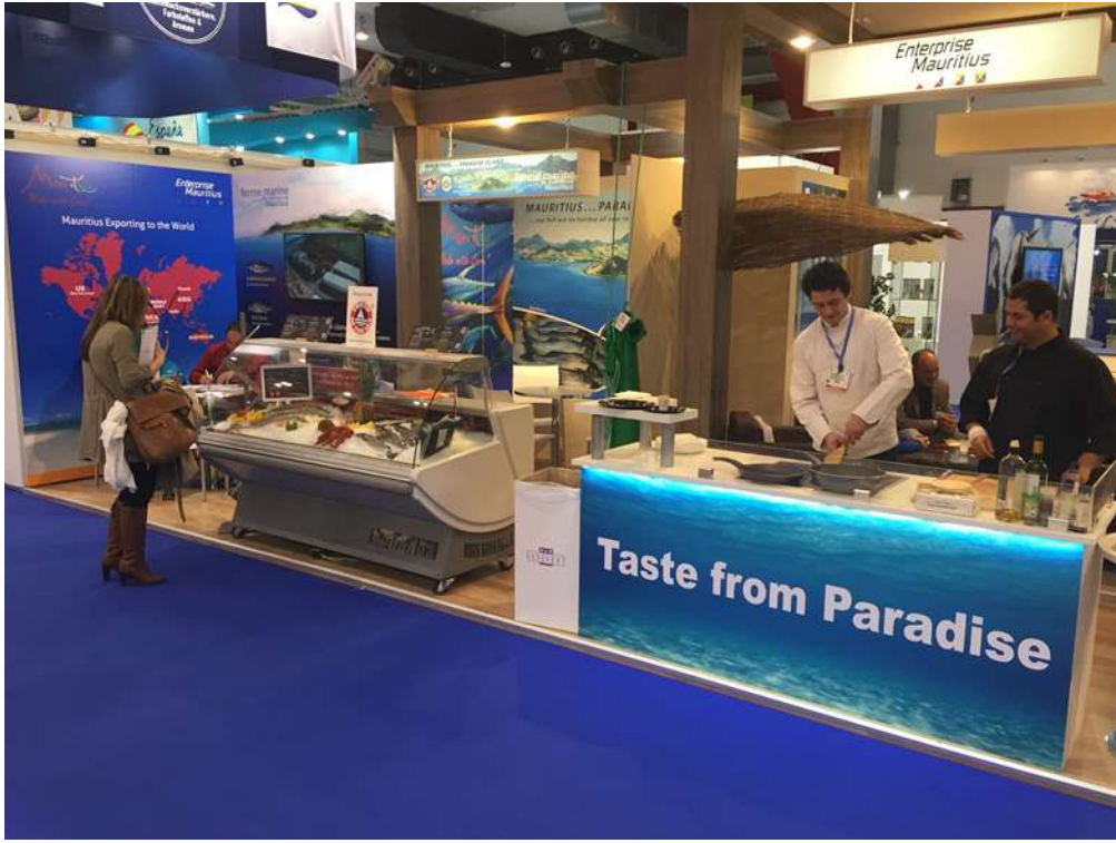
Seafood tasting at the Mauritian Pavilion at Seafood Expo Global