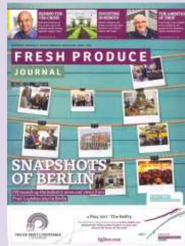
Fresh Produce Journal Fruitnet Media International, UK Issue 4- 2017