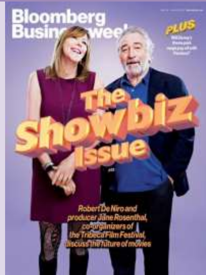
Bloomberg Businessweek Bloomberg Businessweek, New York 20-26 April 2017