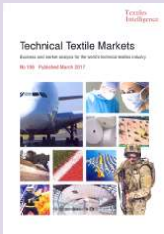
Technical Textile Markets Textiles Intelligence, UK No. 106, March 2017