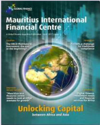
Mauritius International Financial Centre Global Finance Mauritius Issue 5, April 2017