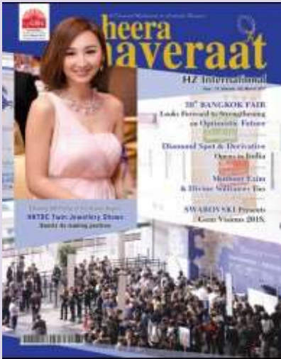
Heera Zaveraat Magazine PJ News & Information Bureau (P) Ltd Mumbai, India Volume 5, March 2017