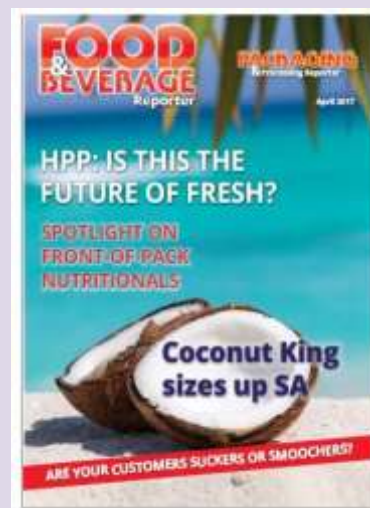
Food & Beverage Reporter + Packaging & Processing Reporter AO Media, South Africa April 2017