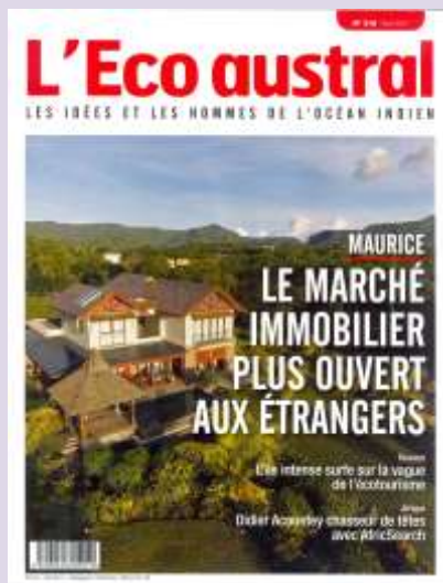
L'Eco Austral Editions Australes Internationales Ltd