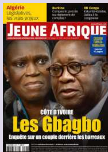
Jeune Afrique Jeune Afrique, Tunis No.2937, 24-29 April 2017