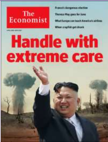
The Economist The Economist Newspaper Ltd 22-28 April 2017