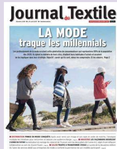
Journal du Textile Journal du Textile, France No.2335, 24 April 2017