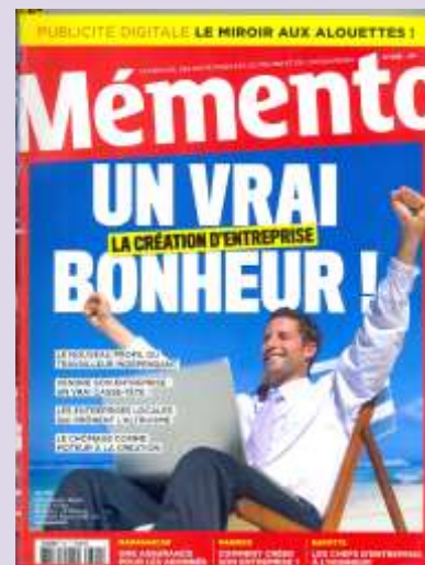
Méméto Studiopress Océan Indien, Réunion