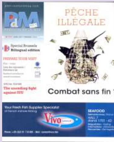
Produits de la Mer (PdM) Infomer No.171, April 2017