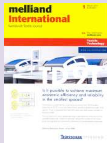
Melliand International Deutscher Fachverlag GmbH March 2017