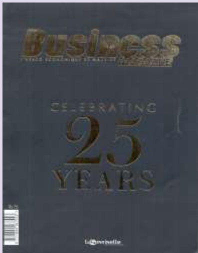
Business Magazine: Celebrating 25 Years La Sentinelle, Mauritius April 2017