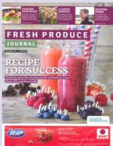
Fresh Produce Journal Fruitnet Media International, UK Issue 5- 2017