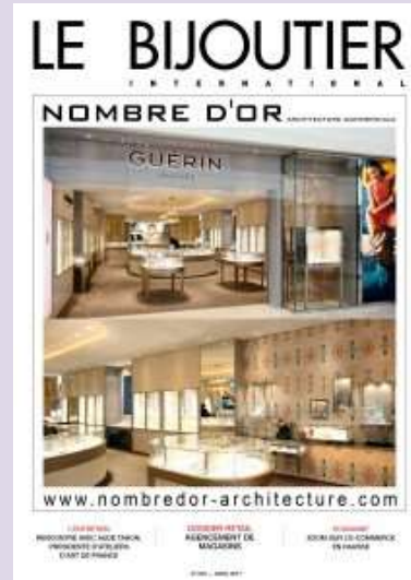
Le Bijoutier International MV Media SAS, Paris No.833, April 2017