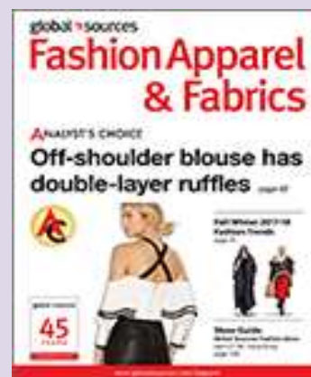
Fashion Apparel & Fabrics Global Sources, Singapore April 2017