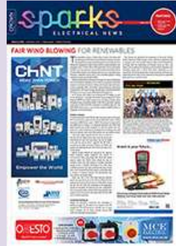
Sparks Electrical News Crown Publications cc, South Africa April 2017