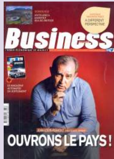
Business Magazine Business Publication Ltd, Mauritius No.1283, 26 April 2017