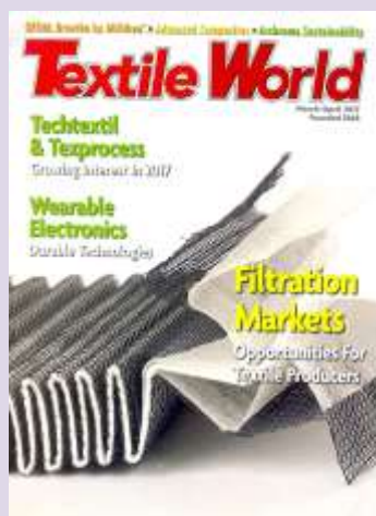
Textile World Textile Industries Media Group, USA March/April 2017