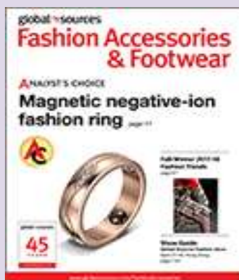
Fashion Accessories & Footwear Global Sources, Singapore April 2017