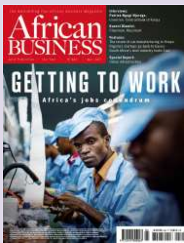
African Business IC Publications, UK April 2017