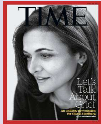
Time Time Inc, USA Vol 189, No.15, 24 April 2017